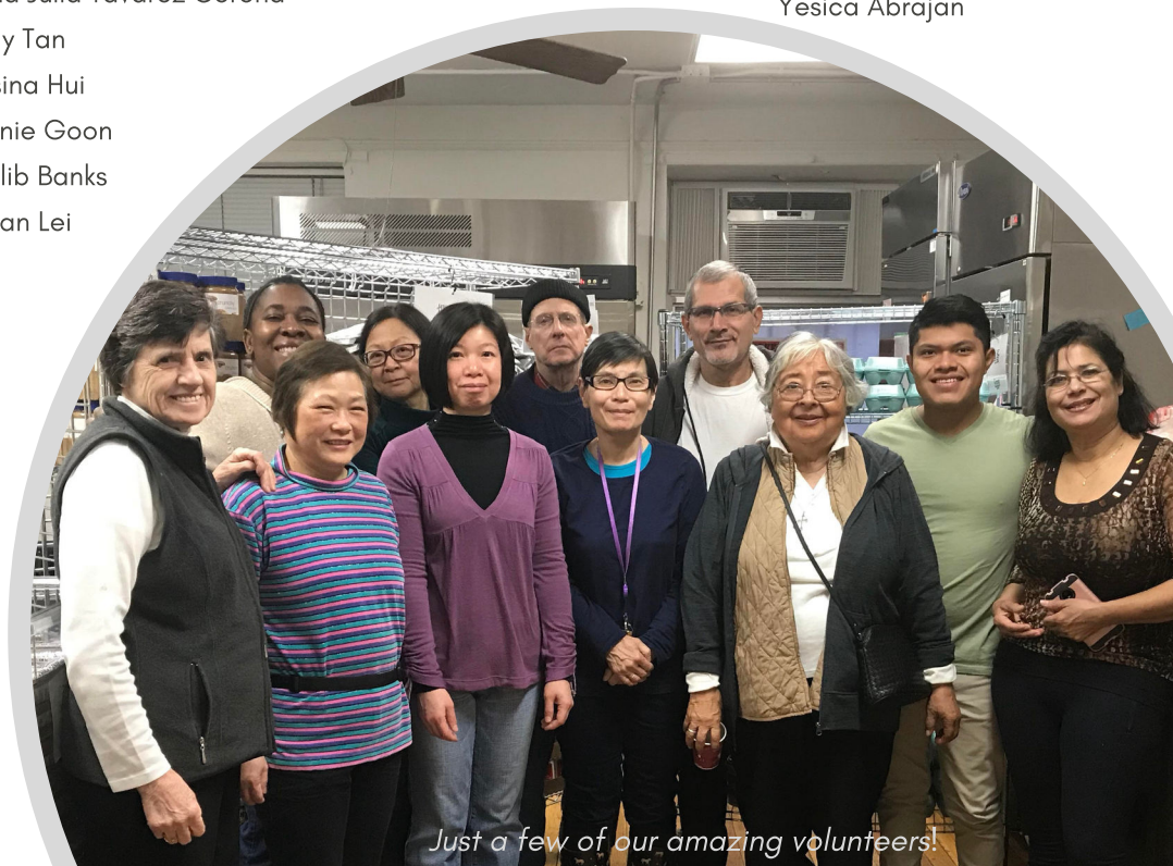
Just a few of our amazing volunteers!